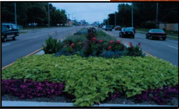
Wye Road Urban Design Guidelines